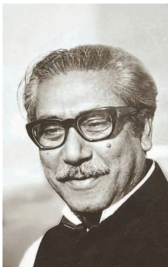
Father of the Nation Bangabandhu Sheikh Mujibur Rahman

On UN General Assembly September 25, 1974